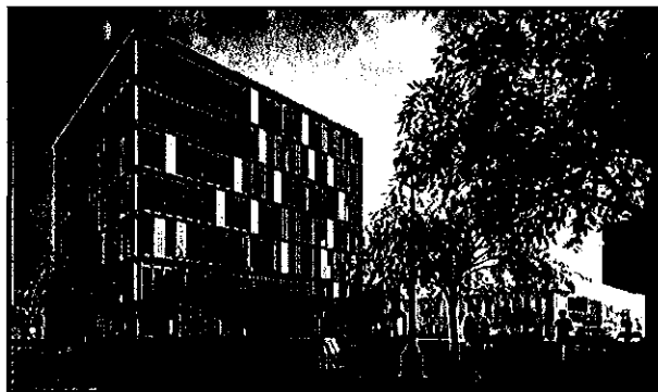
Artist's concept of the WIDC building.

www.unbc.ca/engineering/watch-construction-future-home-engineering-live