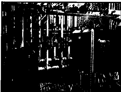
Boiler heating system.